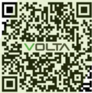
IOS APP Download